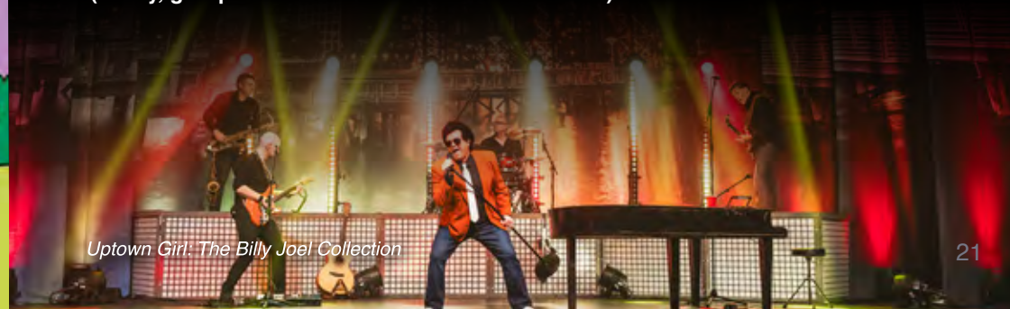
Uptown Girl: The Billy Joel Collection

Friday 28 November to Wednesday 31 December | Tickets from £10 (family, group and school discounts also available)